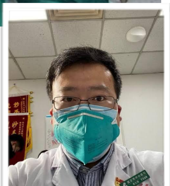
Coronavirus whistleblower Late Dr. Li Wenliang

“We will find a way”, “We are here for you”, “We will cure you, don’t panic” “We are with you”, when heard gives us tremendous ability to fight any illness, it feels like we are in safe hands and our life is dear to them and they will not let us go... They are saviours of Mankind, they are worshiped as Gods in Rural parts, they are respected in the Urban society. They are called A physician (American English), medical practitioner (Commonwealth English),